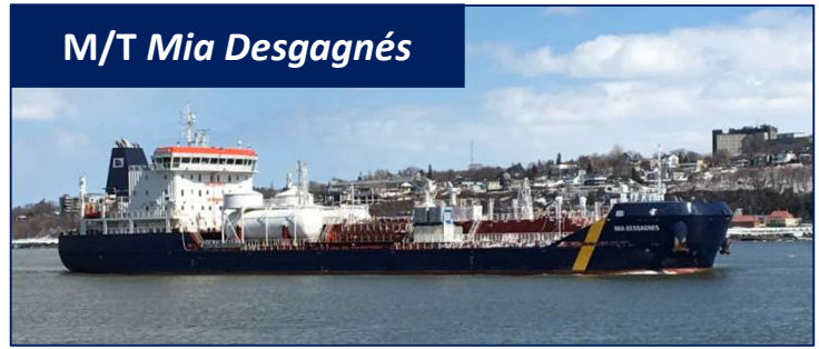
M/T Mia Desgagnés

Tel: 418.692.1000 Fax: 418.692.6044 Email: info@desgagnes.com Website: www.desgagnes.com