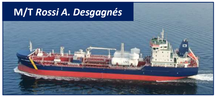
M/T Rossi A. Desgagnés

21 Marché-Champlain Street Québec, Québec G1K 8Z8 Canada Tel: 418.692.1000 Fax: 418.692.6044 Email: info@desgagnes.com Website: www.desgagnes.com